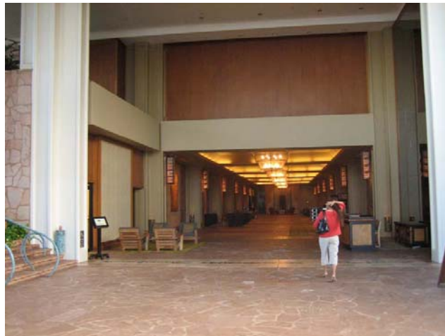
Grand Promenade and Session Rooms

Conference registration badges are required for admittance to all the conference activities, including the reception and banquet.